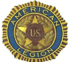
Oro Valley Post 132

(Golf for a Worthy Cause, Lunch at the Mountain View Ballroom, Raffle Prizes and Contest Holes)